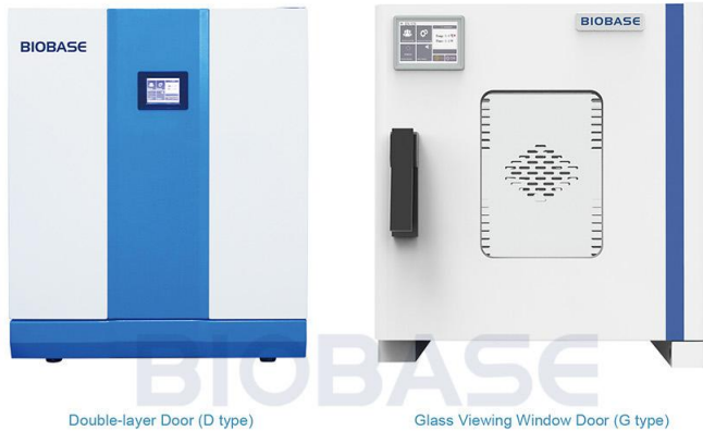
Double-layer Door (D type)